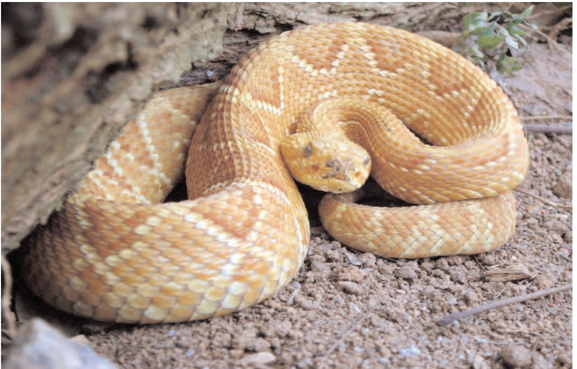
Figure 1. Crotalus durissus terrificus with xanthism. Female (500 mm in snout vent length, 35 mm in tail length, 100 g).

Snakes of the genus Crotalus are terrestrial ambush predators; their most salient characteristic is the presence of a rattle in the tip of the tail. In Brazil there is only a single species, Crotalus durissus , which has a large distribution within savannah ( cerrado ), arid regions ( caatinga ) and open areas (Melgarejo, 2003). There are a few reported cases of albinism in this species (Amaral, 1927a; Amaral, 1932; Amaral, 1934; Duarte et al. , 2005) and also melanism (Silva et al. , 1999). This note reports a case of xanthism in a specimen of Crotalus durissus terrificus . The snake, a young female (500 mm in snout vent length, 35 mm in tail length, and 100g), was collected in Lindóia – SP (22°31'S; 46°39'W) in July 2005, with two other individuals of a similar size, but with normal colour patterns. This individual is yellow throughout the entire body, including the head, with lighter stains in the post-ocular region. The characteristic dorsal markings are dark yellow, bordered with scales of lighter yellow. The nape marking is also dark yellow, bordered by light yellow scales, and the gular region is light